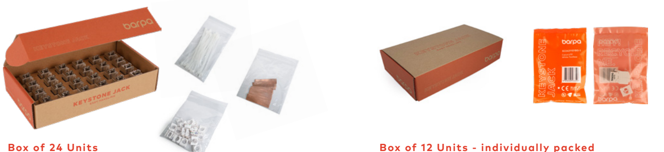
This images are merely illustratives. We want you to see the importance we attach to the packaging. We always work with products and materials that are easy to use.